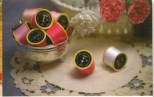
Art 4509/tkt 50 Anchor Mercer Machine embroidery 600m spool