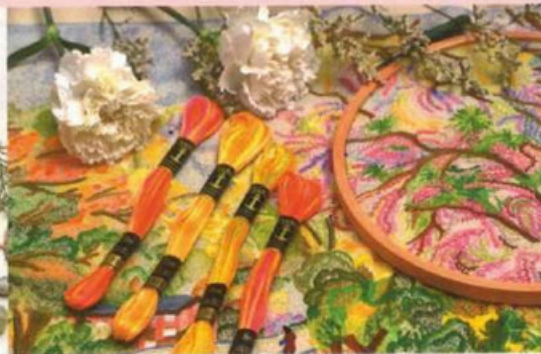
Art 4615 Anchor Stranded Multicolour Cotton 8 m skeins