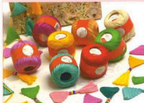
Art 4060 Anchor Mercer Knitting cotton 4ply 50 g ball