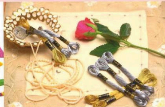
Art 4652 Anchor Stranded Metallic 8 m skeins