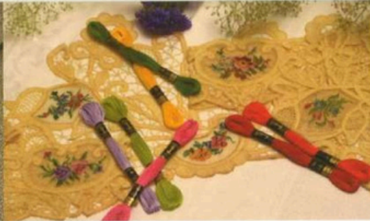
Art 4625 Anchor Stranded Cotton 8 m skeins