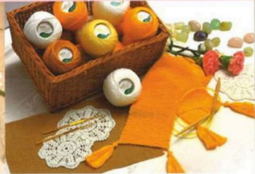
Art 4057 Anchor Mercer Knitting Cotton 50g ball