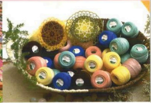
Art 4054/tkt 40 Anchor Mercer Crochet 20g ball