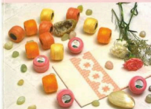
Art 4591/tkt 8 Anchor Mercer Pearl Cotton 10 g ball