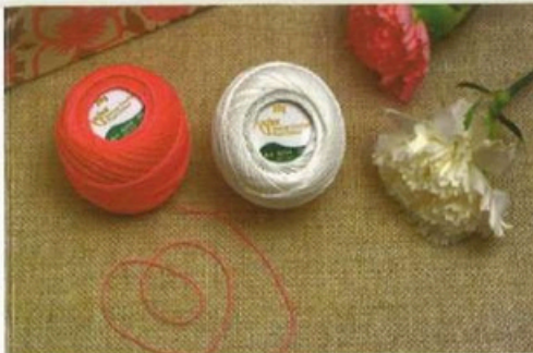
Art 4054/tkt 20 Anchor Mercer Crochet 20g ball